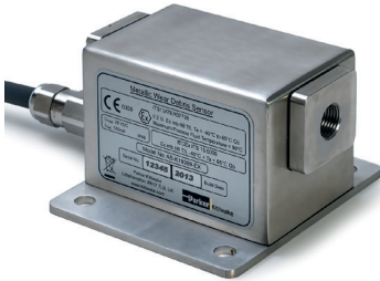
MWDS shown in picture is ATEX zone 1 version

Parker's Kittiwake latest generation of metal wear debris sensors provides unbeatable detection performance for both ferrous and non-ferrous metals. It is known in the market that particles result from wear processes in hydraulic and lubrication systems.