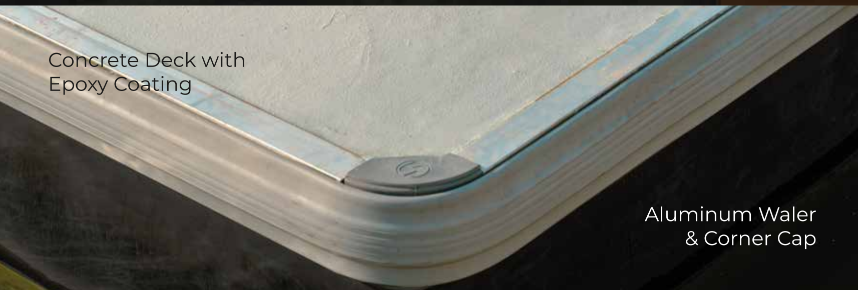
Concrete Deck with Epoxy Coating