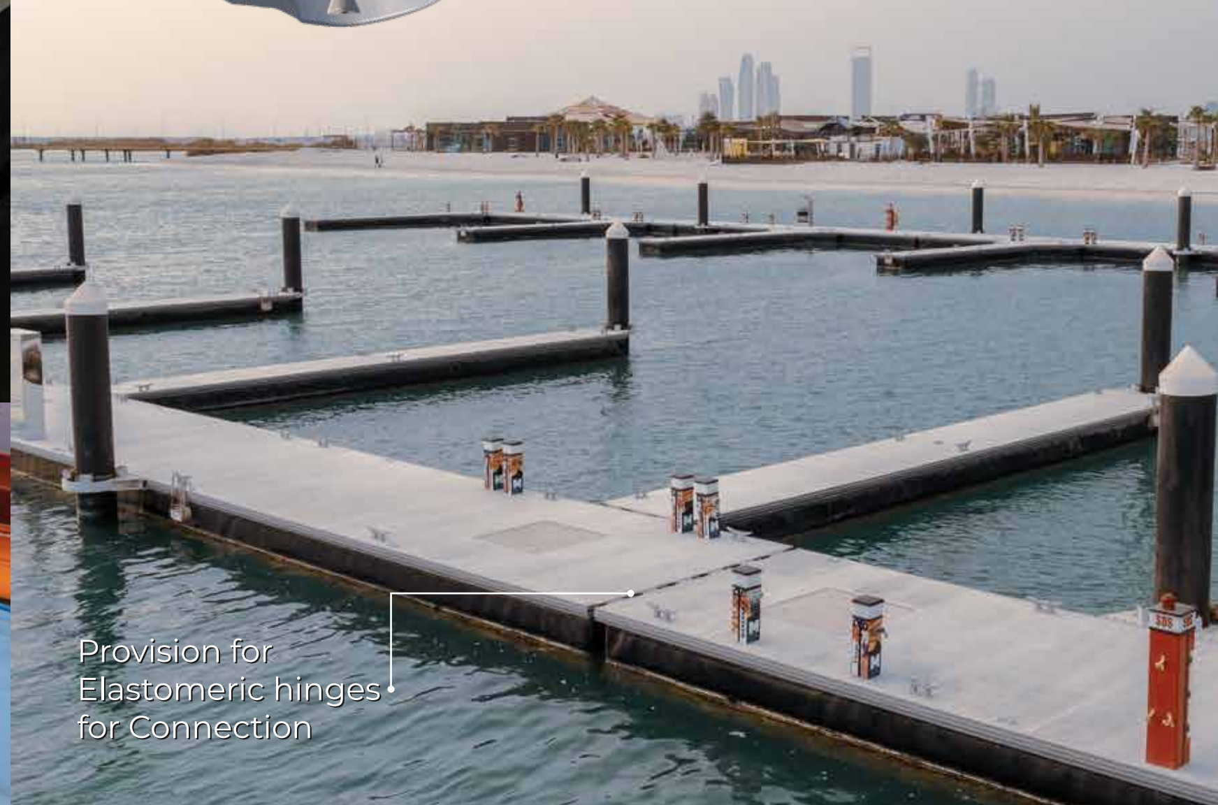
Provision for Elastomeric hinges for Connection