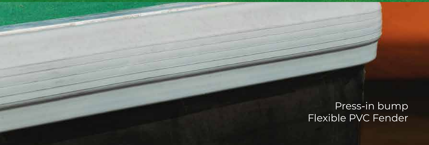
Press-in bump Flexible PVC Fender