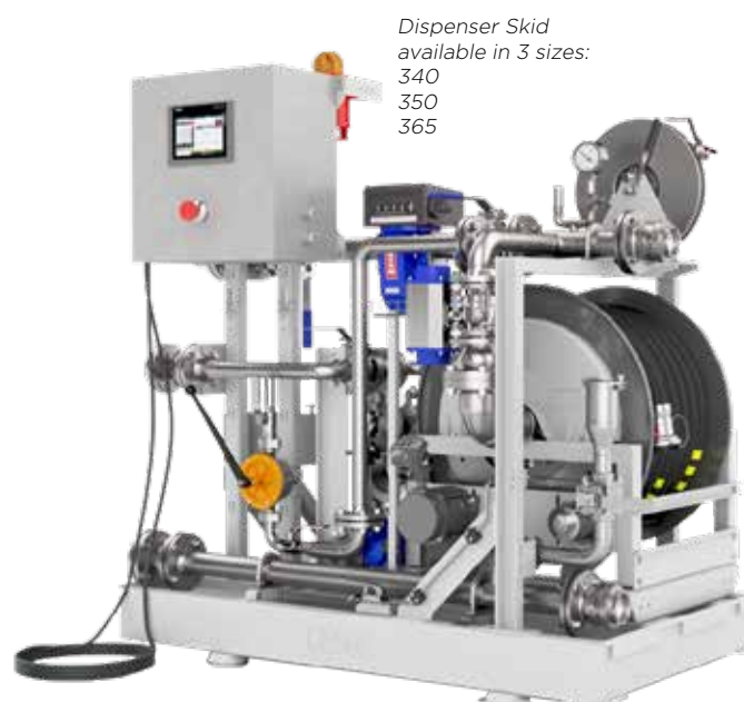
Dispenser Skid available in 3 sizes: 340 350 365