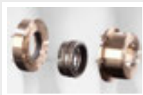
Stern Tube Seal