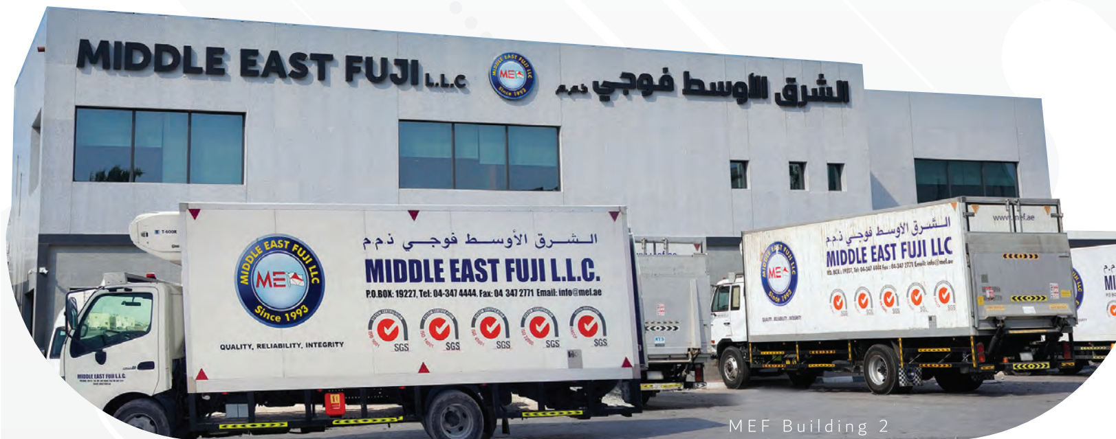
MEF Building 2